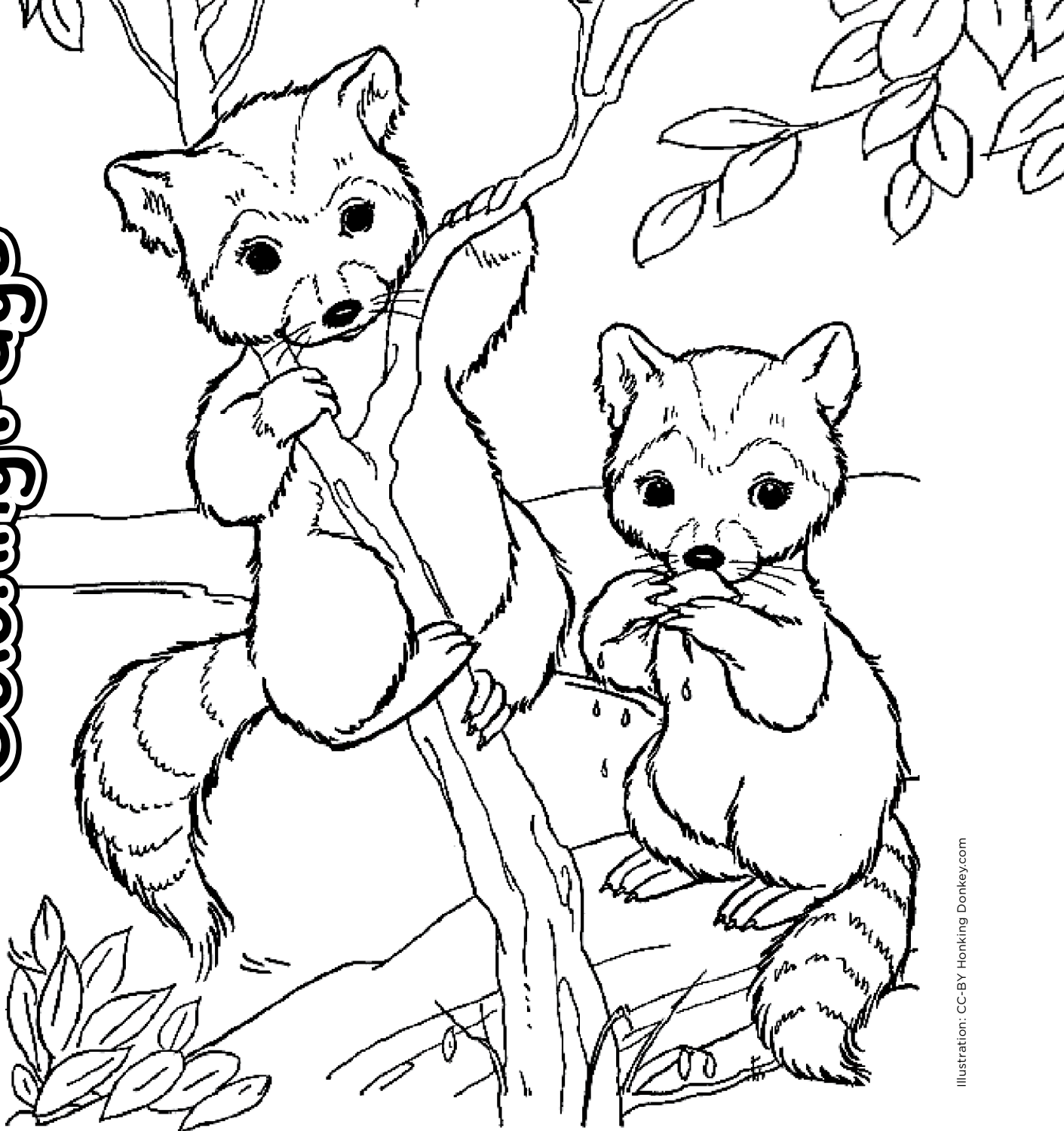
Illustration: CC-BY Honking Donkey.com