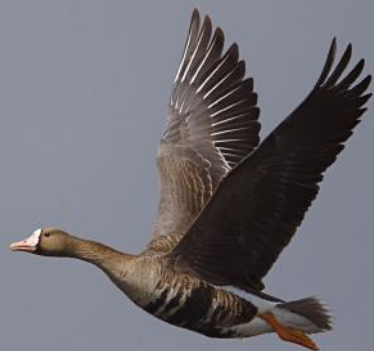
Greater White-fronted Goose

In early spring, starting in late February and continuing into March, the WMA becomes a spectacle of migratory activity, particularly for Snow Geese and Greater White-fronted Geese. Flocks numbering up to 60,000 Snow Geese and 40,000 Greater White-fronted Geese descend upon the wetlands, creating an amazing display of movement and sound.