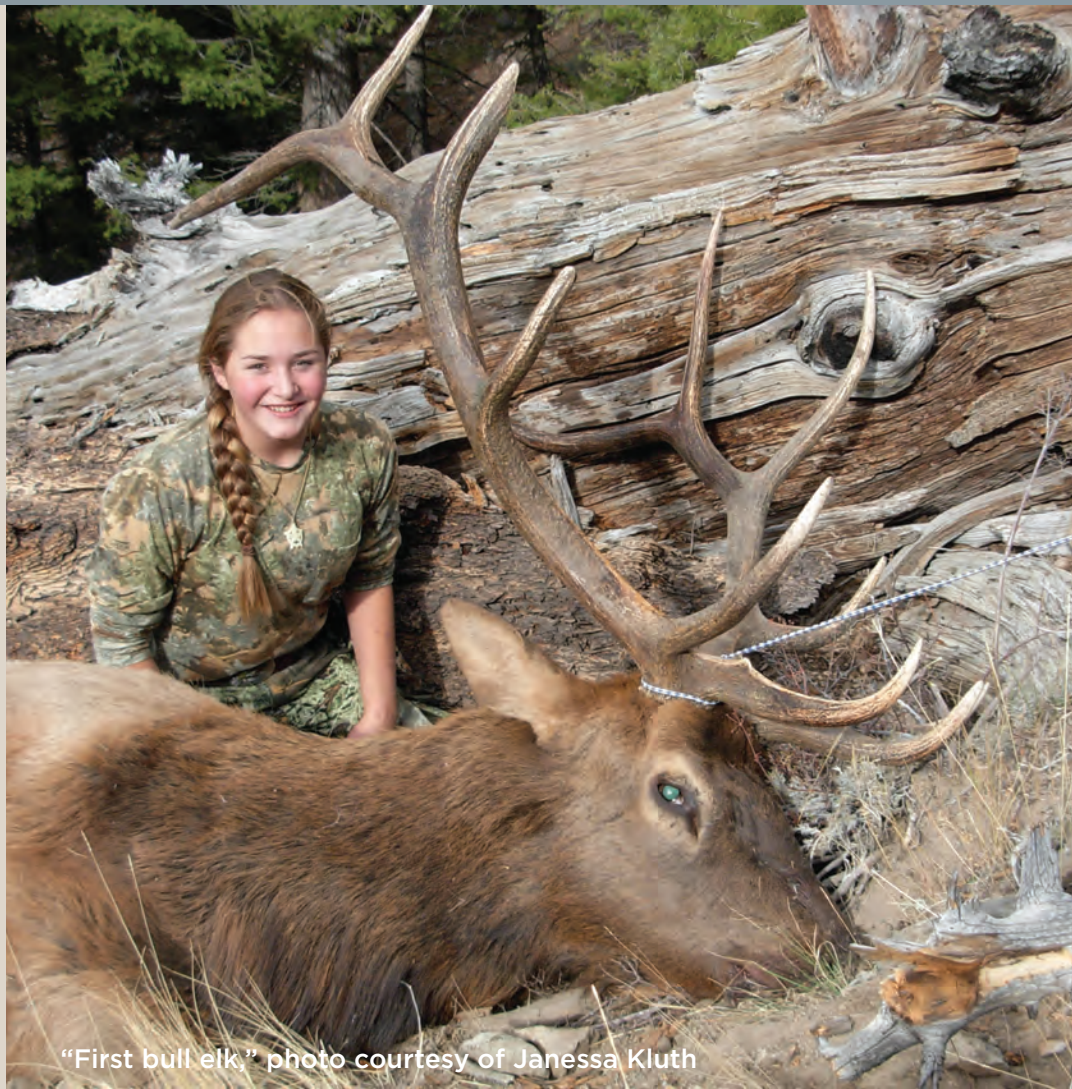
“First bull elk.”