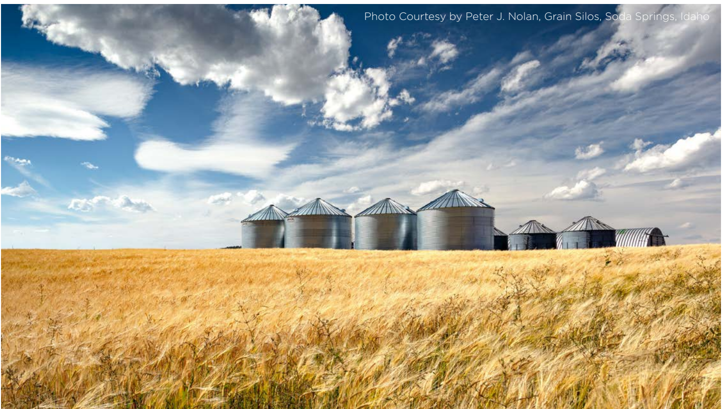
Grain Silos, Soda Springs, Idaho