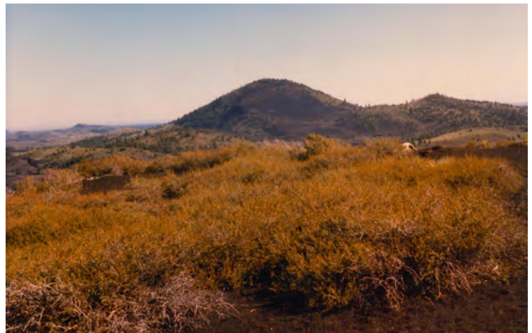
Summer at Craters of the Moon