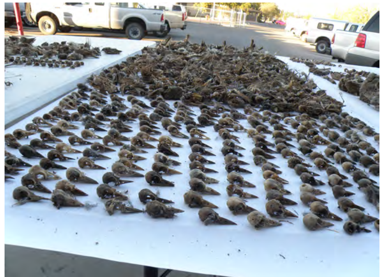
Birds collected from inside some of Nevada's mining claim posts.