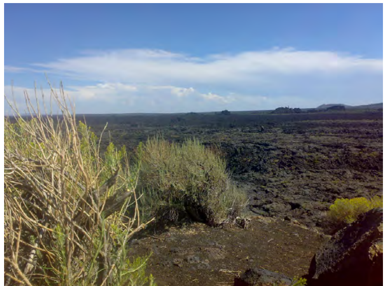
Looking out into the lava; photo used under Creative Commons from chip_p