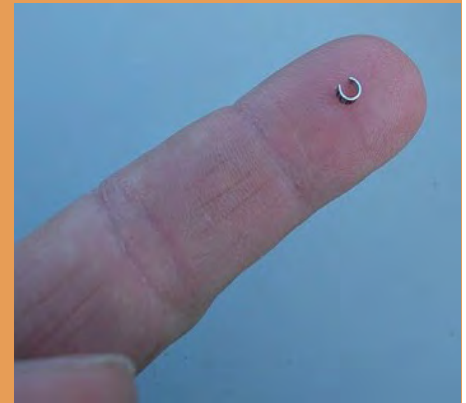
Hummingbird band

They fly at speeds up to 30 miles per hour.