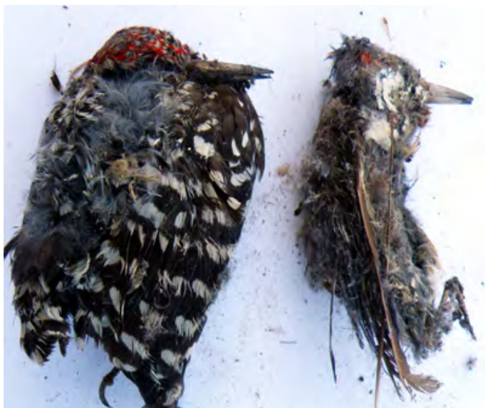
Ladder-back woodpeckers found dead in mining claim marker pipes; photo by Christy Klinger.