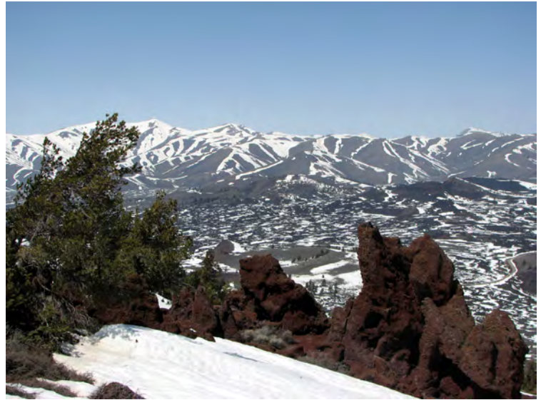
Winter at Craters of the Moon

For more state-by-state information on national parks and how the National Park Service is working with communities go to www.nps.gov/STATE , for example: http://www.nps.gov/idaho