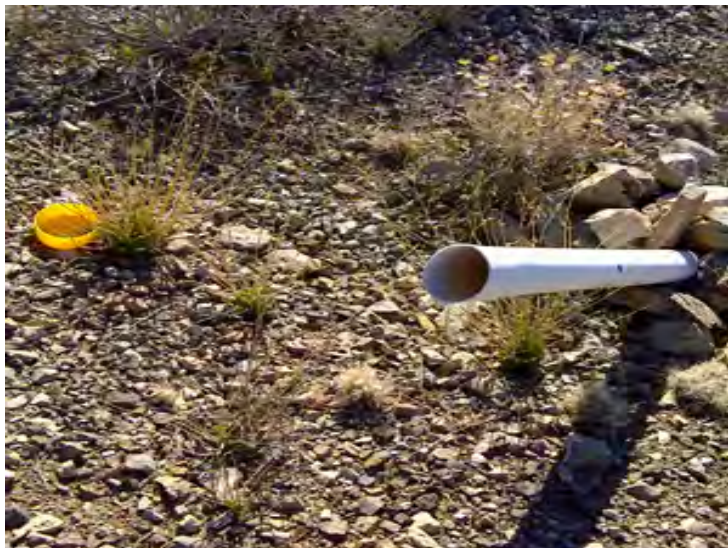
A mining claim marker with the cap blown off; photo by Christy Klinger.

The letter calls on the Federal agencies to ".....reduce the needless mortality of millions of birds across the United States, and to establish a way to require states not to use uncapped or otherwise hazardous pipe as markers for mining claims and sites."