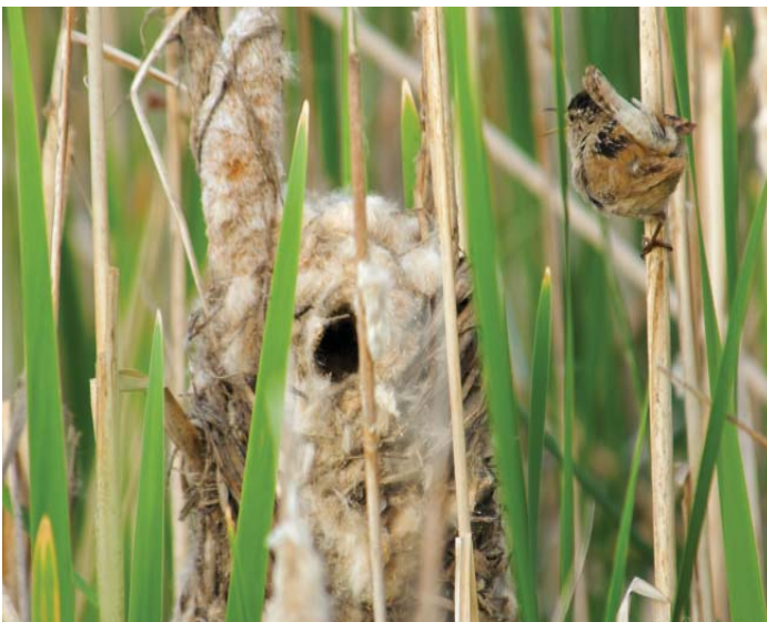
Marsh wren nests are softball-sized structures made of grasses and sedges, fashioned with an entrance hole that usually faces south or west. The nests are attached to the stems of marsh vegetation and are located from one to three feet above water level.

The nest of the Bullock's oriole hangs like a sack below a branch. These nests seem like an incredible feat of engineering, accomplished by a creature with a brain smaller than a marble.