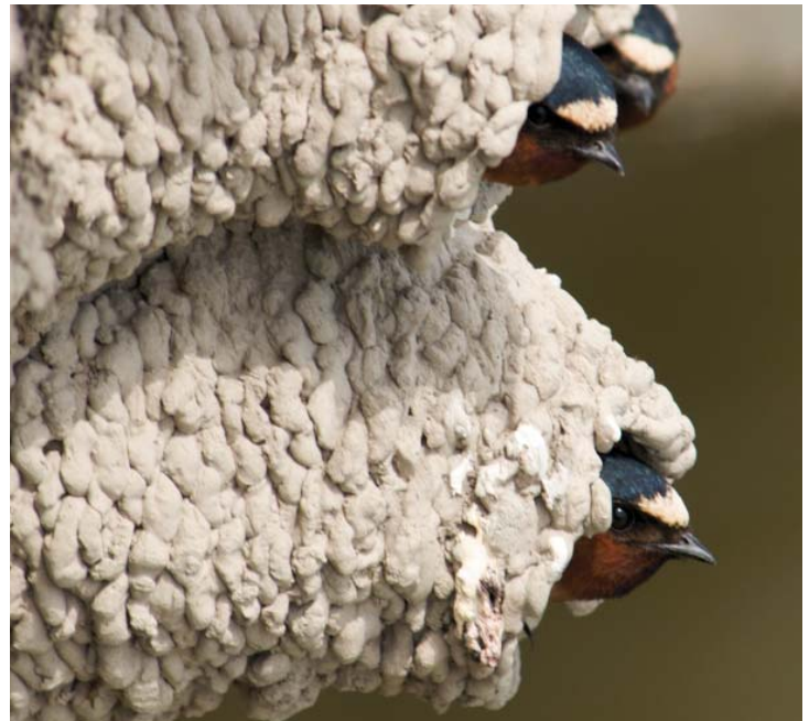
Cliff swallow nests are gourd-shaped, enclosed structures built of mud pellets and are cemented with mud under the eave of a building, bridge, or other vertical surface.

Nests are made from all types of materials. Grass and twigs are used in most nests but mud is also common. Some birds line their nests with mud, and swallows construct cups or complete enclosed nests one ball of mud at a time.