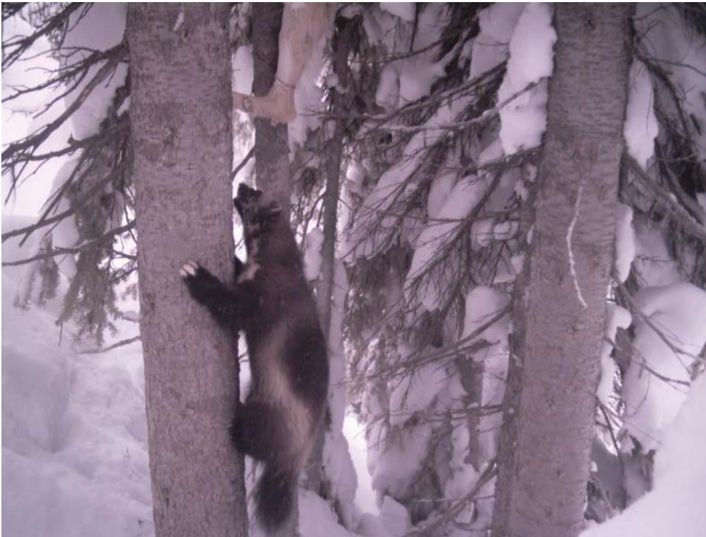
This wolverine was detected at a baited remote camera in 2008. She is the first individual live-trapped in the 2010 study, based on distinctive white toe markings.

The remote areas wolverines occupy are no longer truly remote in winter due to increasing recreational activity. This study compares wolverine movements with those of snowmobilers and back-country skiers to determine the extent of overlap in both time and space. The Idaho State Snowmobile Association, Central Idaho Recreation Coalition, and Brundage Ski Area are collaborators, along with IDFG and the Boise and Sawtooth National Forests. Similar to radio collars on the animals that store location data, recreationists carry a small GPS unit when they head out for a day in the backcountry. Participation is strictly voluntary and anonymous. Their 'track' is downloaded and added to a growing recreation database. The collective group of recreation tracks will be overlaid with wolverine data to examine how wolverines move across the landscape given the presence and timing of recreation activity. Thus far, cooperation has