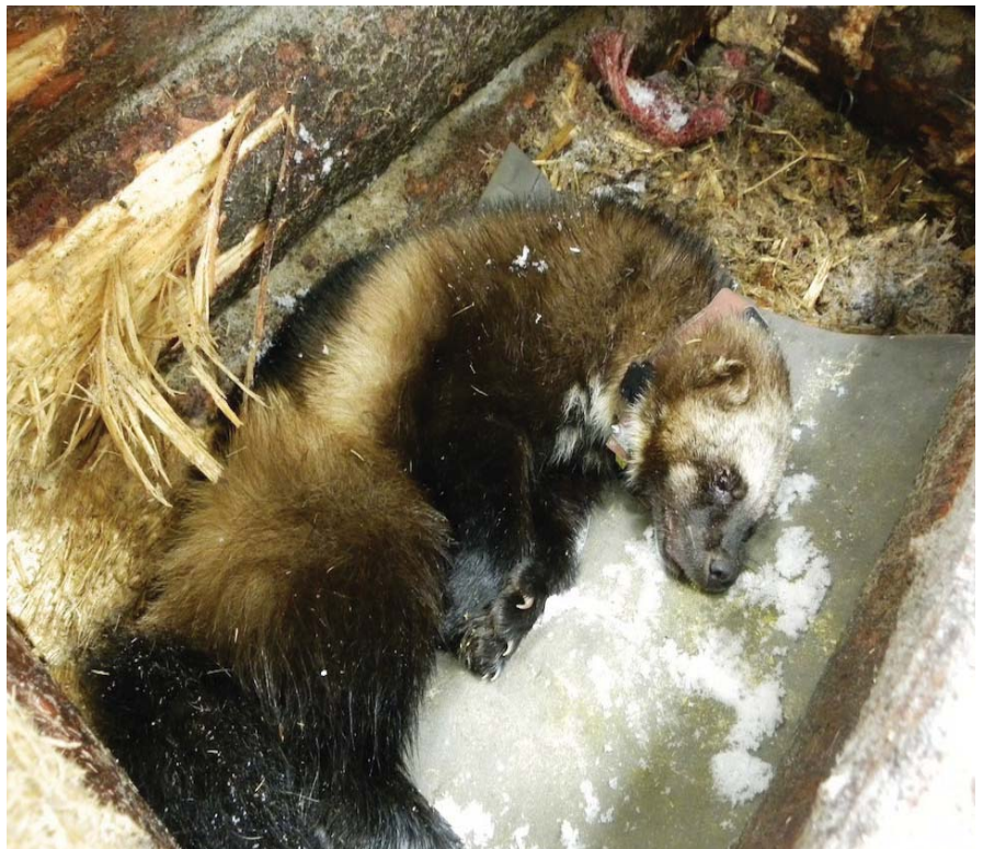
A radio-collared wolverine, soon to be released, recovers from anesthesia in the trap in which it was caught.

Personality: Feisty and fearless. After release, eluded detection for 32 days before her signal was heard again.