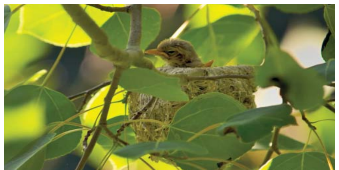
Warbling vireo's build a cup-like nest and can be made of bark strips, grass, leaves, plant fibers, hair, and lichen.

Before spring paints the world green, get out in your yard or favorite haunt and do a little searching for last year's nests.