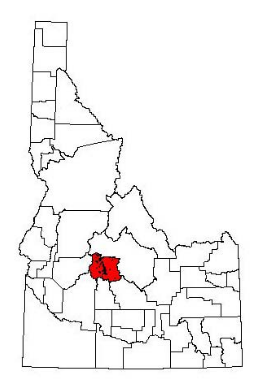
Figure 2. Location of the Sawtooth National Recreation Area in central Idaho.

Management special status plant species in southwestern Idaho (Mancuso and Miller 2004). Information and maps contained in the IDCDC Element Occurrence Record (EO Record) database (Idaho Conservation Data Center 2005) were used to help relocate occurrences in the field. At each occurrence we conducted a reconnaissance to determine the distribution of White Cloud milkvetch in the area. We subjectively located monitoring transects where White Cloud milkvetch plants were relatively abundant to ensure adequate sampling.