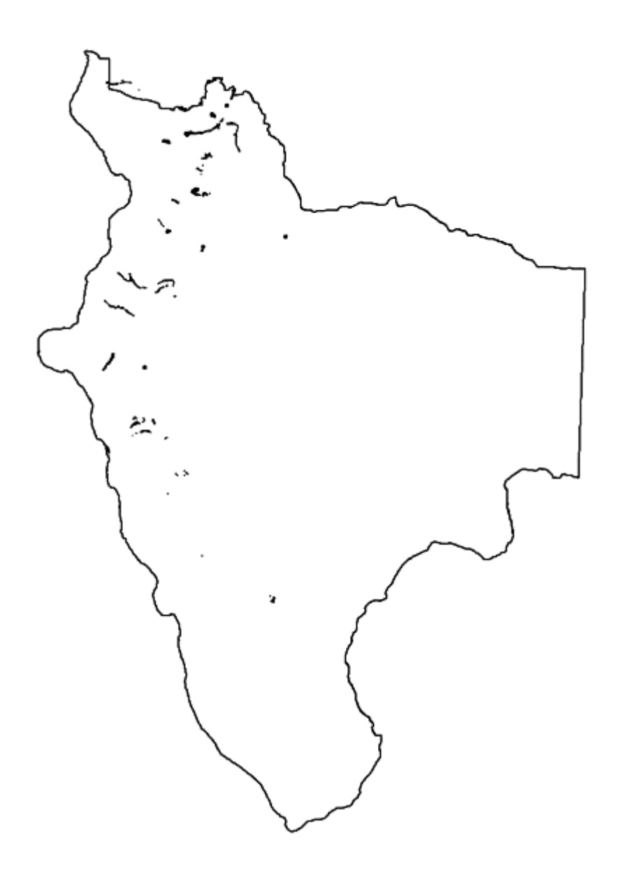
Figure 3. Known distribution of Palouse goldenweed on Craig Mountain.

Habitat: Palouse goldenweed occupies native bunchgrass grasslands in the Palouse Grasslands and Canyon Grasslands, and transition zones between grasslands and ponderosa pine ( Pinus ponderosa ) or Douglas-fir ( Pseudotsuga menziesii ) habitats. High quality representation of these habitats is very limited within the range of Palouse goldenweed. Most of the original Palouse Grasslands have been converted to agricultural uses. In more recent decades, large-scale invasion by yellow starthistle ( Centaurea solstitialis ), cheatgrass ( Bromus tectorum ), and several other introduced, aggressive weeds has degraded large segments of the Canyon Grasslands ecosystem.