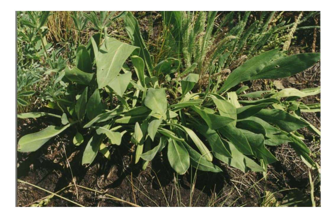
Figure 4. Photo of Palouse goldenweed exposed to herbicide drift in Cave Gulch, 6 June 2001. The area was backburned in 2000 during the Maloney Creek fire.

Middle Creek (Element Occurrence # 62): Palouse goldenweed occurs on the two major ridges south of Middle Creek. The ridge immediately south of Middle Creek (the Fourth North Bench) has an estimated 4000 plants scattered on open, grassy hillsides and near bunchgrass/dry forest ecotones. Flat areas and southern slopes adjacent to the populations are very weedy, with abundant yellow starthistle and cheatgrass. About 550 plants occur on the second ridge south of Middle Creek (Third North Bench). There are three small subpopulations on the hillside below the road that runs from Corral Creek toward Middle Creek. They occur in relatively good quality bunchgrass communities. However, there are some vellow starthistle satellites on the hillside, and the flat ridgetop above them is heavily infested with yellow starthistle, cheatgrass, field bindweed ( Convolvulus arvensis ), medusahead ( Taeniatherum caput-medusae ) and cylindrical goatweed ( Aegilops cylindrica ). Above the road, Palouse goldenweed occurs in a relatively flat area in a snowberryrose/bunchgrass mosaic, and also in grassy openings in the dry forest stringer on the northerly aspects of the ridge to the east. The south-facing aspects adjacent to the subpopulations have yellow starthistle/cheatgrass patches that have begun to encroach upon the more northerly aspects that support Palouse goldenweed habitat. A patch of Canada thistle (Cirsium arvense) is established just east of the road.