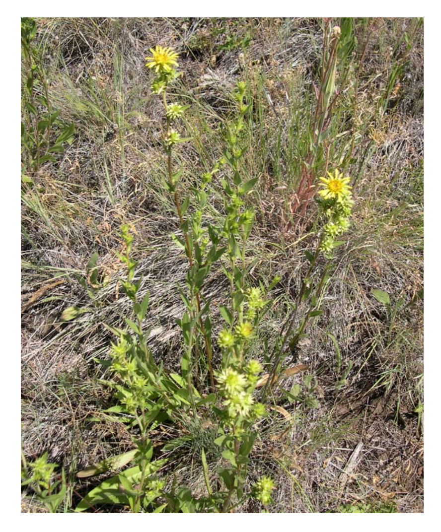
Figure 1. Photo of Palouse goldenweed.

The genus Pyrrocoma has a base chromosome number of x = 6. Palouse goldenweed is hexaploid, with a chromosome count of n = 18 (Anderson et al. 1974, Mayes 1976).