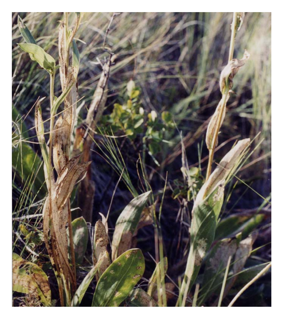
Figure 5. Leaf herbivory of Palouse goldenweed. The green tissue has been mined, leaving a filigree pattern of veins.

Aerial herbicide spraying has taken place in some areas that support Palouse goldenweed (Figure 4) and other rare plant species. Herbicide drift can have a direct adverse effect on rare plants and their associated native plant community (Appendix C, Photo 8).